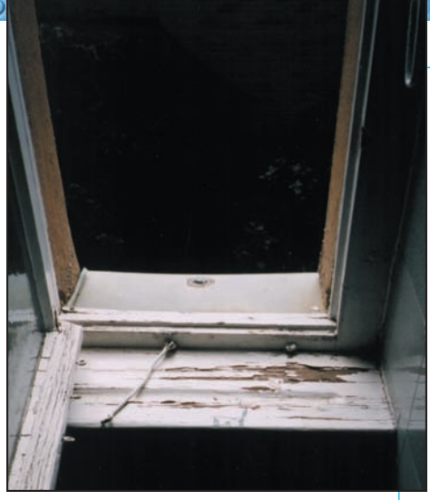
Leaky window – mold is beginning to rot the wooden frame and windowsill.

If you already have a mold problem – ACT QUICKLY. Mold damages what it grows on. The longer it grows, the more damage it can cause.