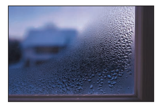
Condensation on the inside of a windowpane.

Keep indoor humidity low. If possible, keep indoor humidity below 60 percent (ideally between 30 and 50 percent) relative humidity. Relative humidity can be measured with a moisture or humidity meter, a small, inexpensive ($10-$50) instrument available at many hardware stores.