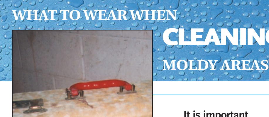
Mold growing on a suitcase stored in a humid basement.

It is important to take precautions to LIMIT YOUR EXPOSURE to mold and mold spores.