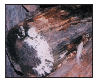
Mold growing outdoors on firewood. Molds come in many colors; both white and black molds are shown here.

Why is mold growing in my home? Molds are part of the