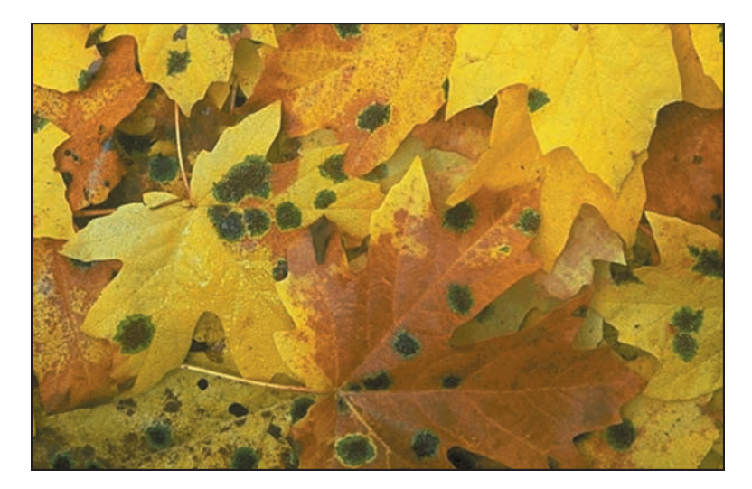
Mold growing on fallen leaves.

This document is available on the Environmental Protection Agency, Indoor Environments Division website at: www.epa.gov/mold