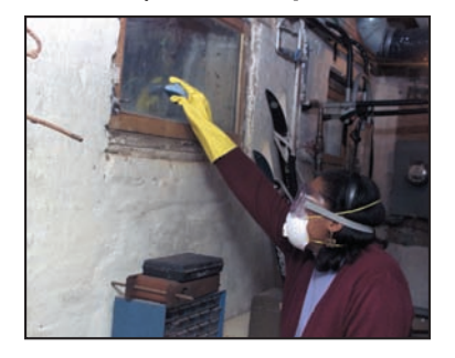
Cleaning while wearing N-95 respirator, gloves, and goggles.

Wear goggles. Goggles that do not have ventilation holes are recommended. Avoid getting mold or mold spores in your eyes.