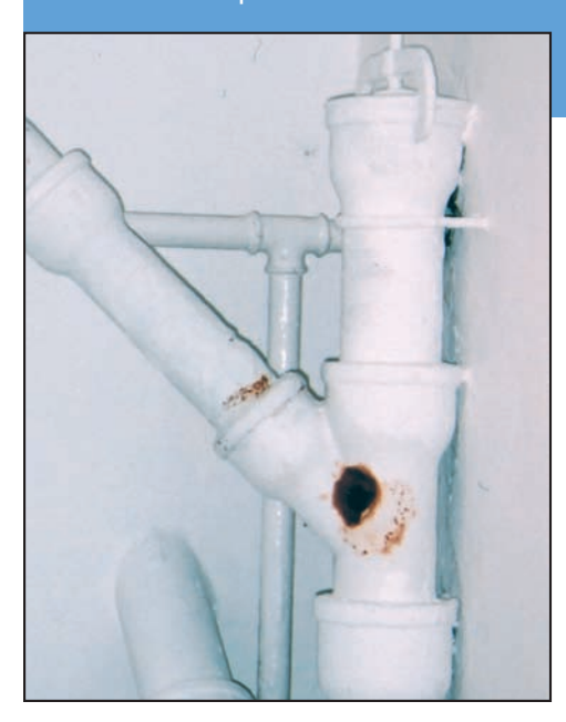
Rust is an indicator that condensation occurs on this drainpipe. The pipe should be insulated to prevent condensation.

Renters: Report all plumbing leaks and moisture problems immediately to your building owner, manager, or superintendent. In cases where persistent water problems are not addressed, you may want to contact